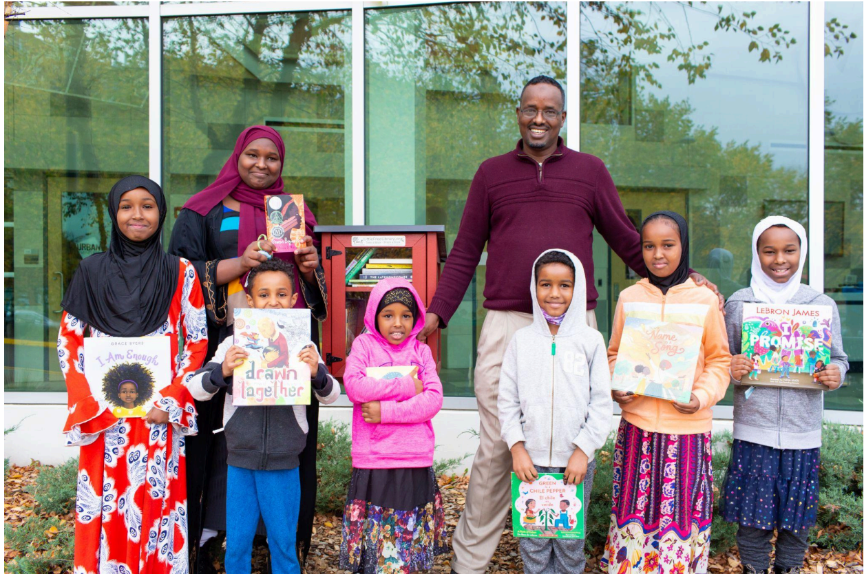
Read in Color in Minneapolis