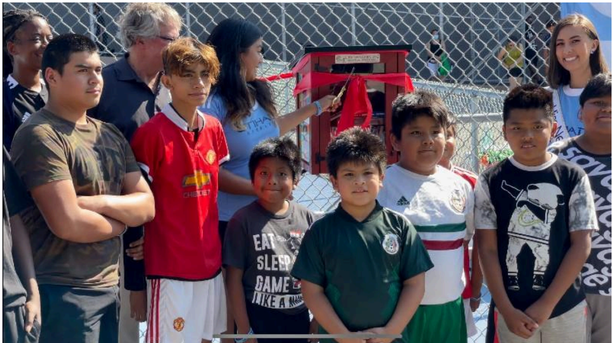
Read in Color in the Bronx, NYC