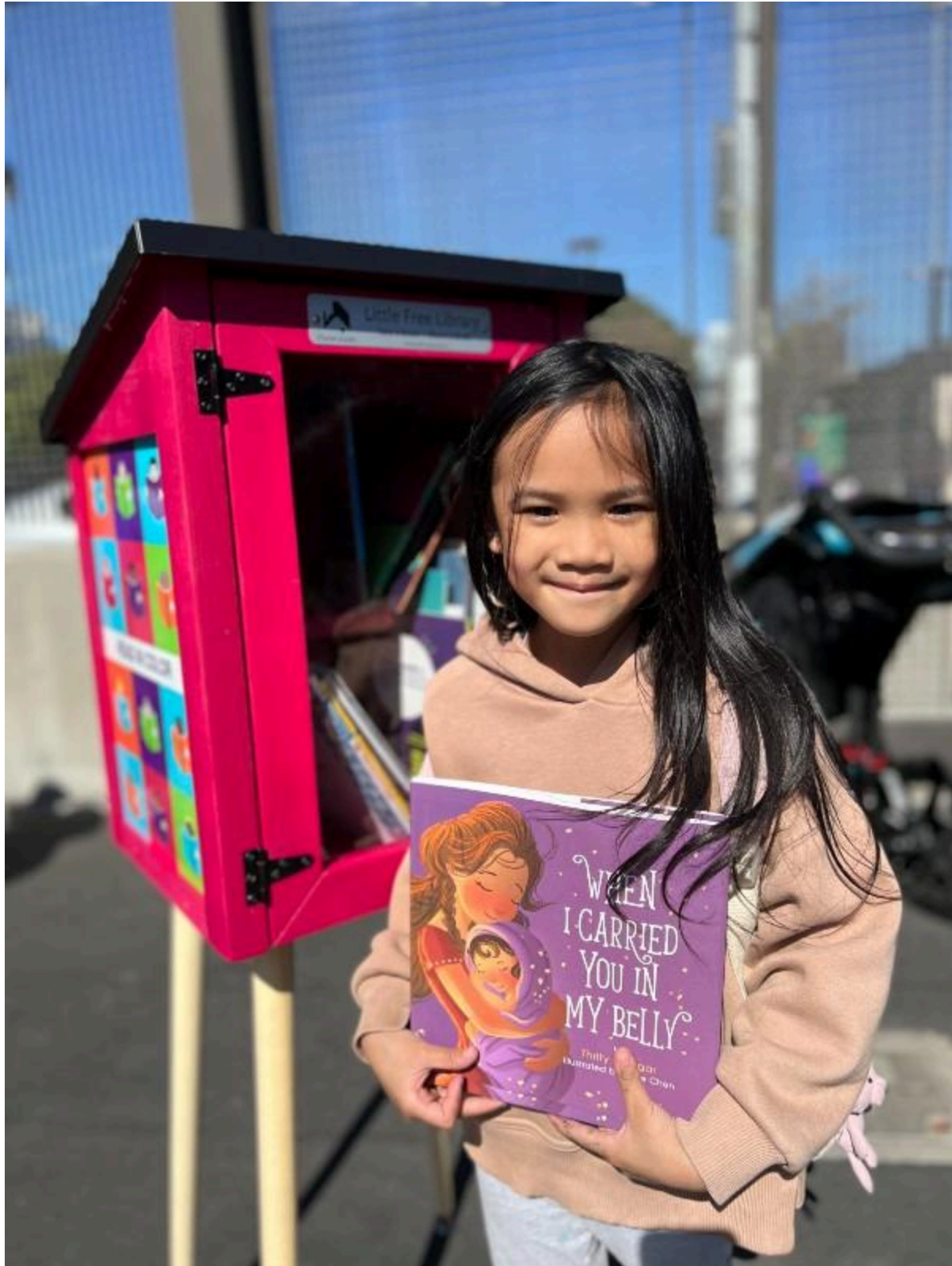
Read in Color in San Francisco