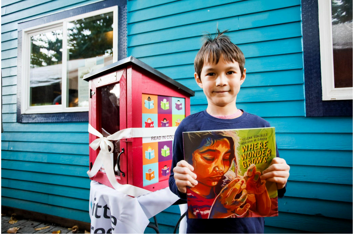
Read in Color in Portland