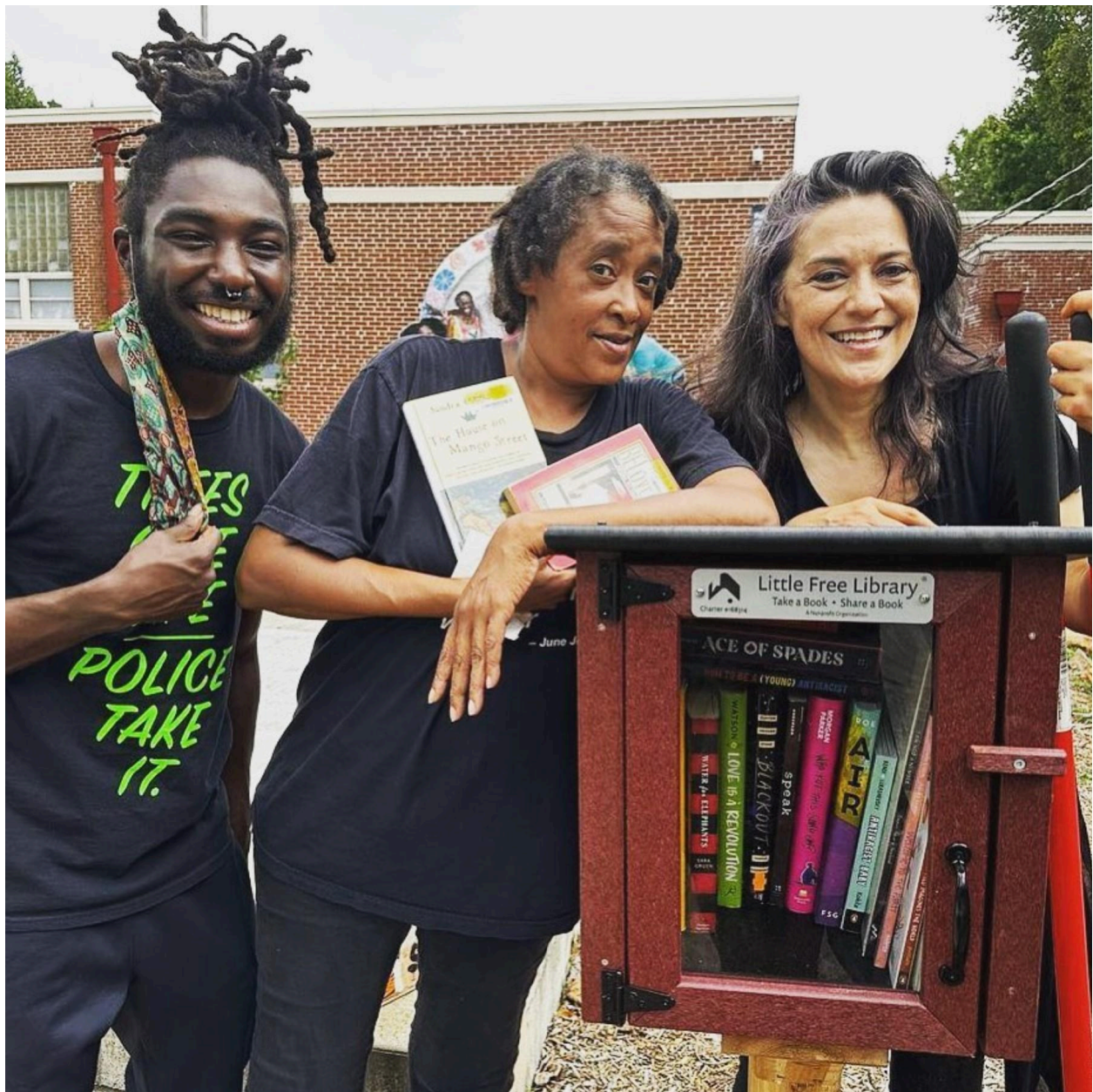
Read in Color in Atlanta