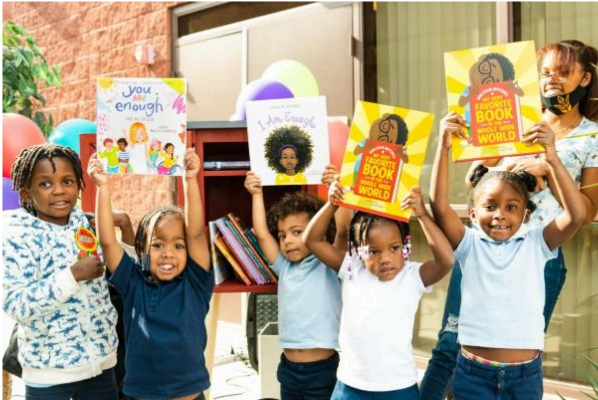
Read in Color in Phoenix