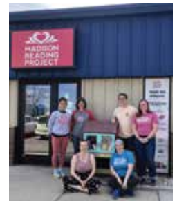
Madison Reading Project Madison, Wisconsin

You can put books in kids' hands. Thank you for your support!