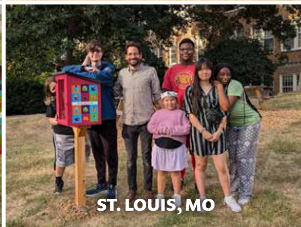
ST. LOUIS, MO