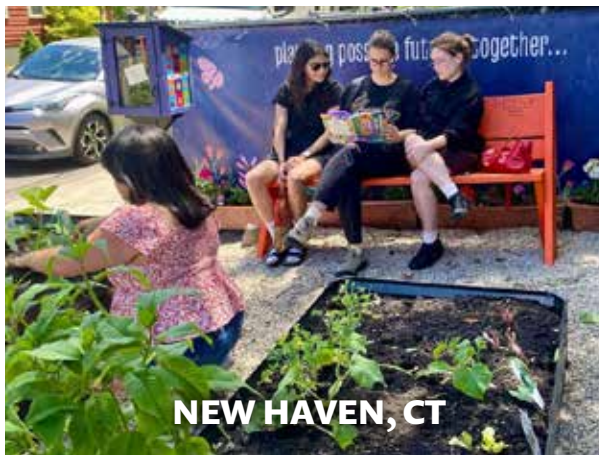
NEW HAVEN, CT