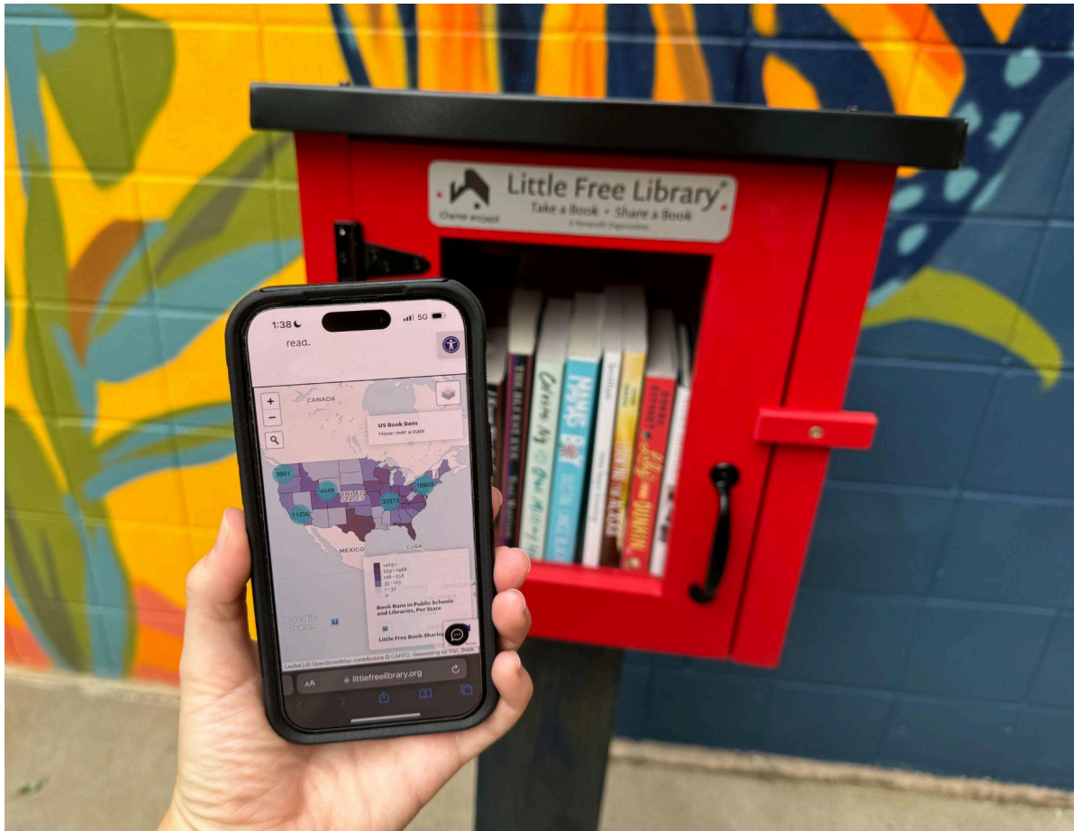
Map users can see the number of Little Free Libraries in an area, along with the number of book bans.