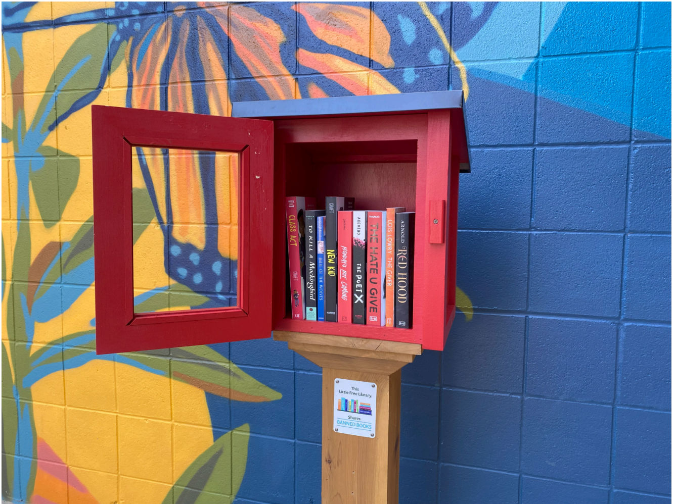
A Little Free Library book-sharing box filled with banned titles.