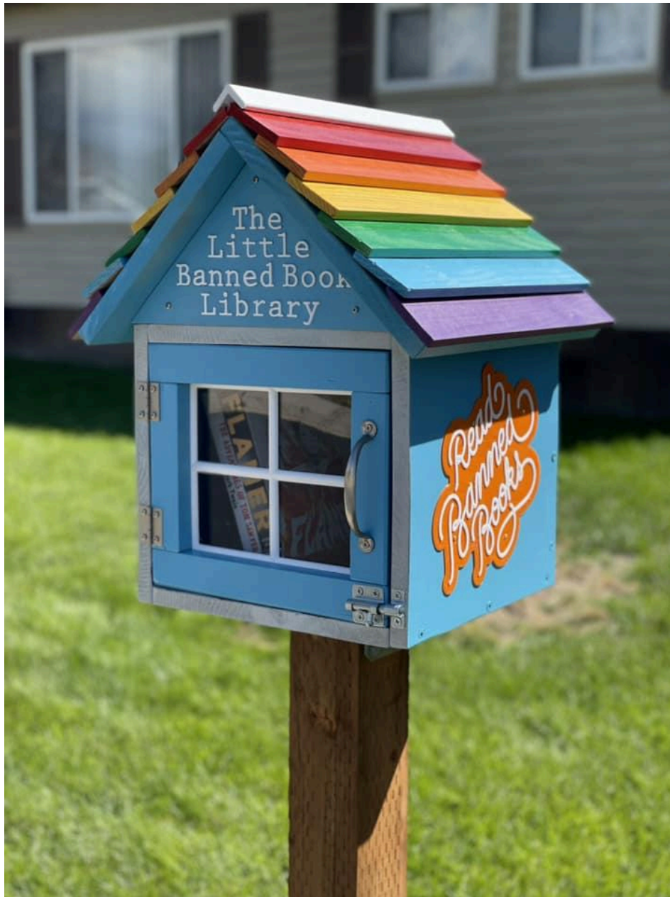
Little Free Library book-sharing box charter number #172913 in Washington Terrace, Utah, is focused on providing access to banned and challenged books.