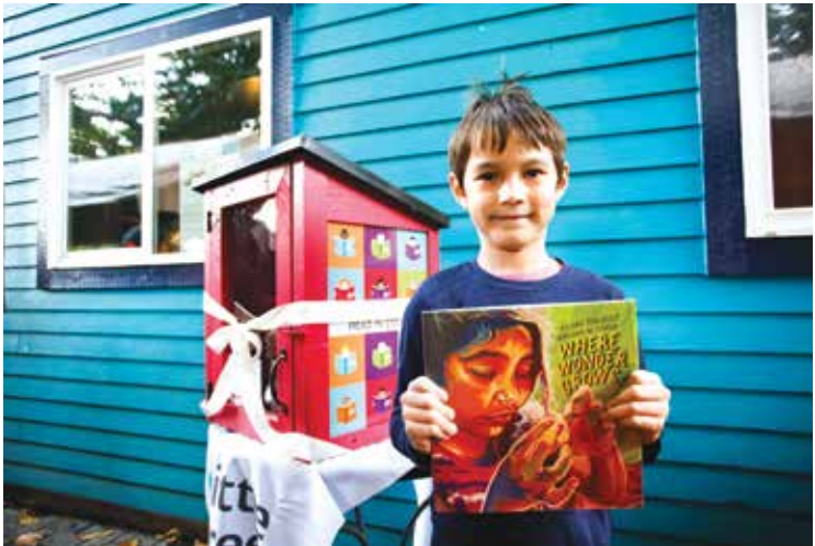
A young reader finds the book Where Wonder Grows at the Little Free Library Read in Color launch in Portland, Oregon.

Your gift today, in any amount that is meaningful to you, is needed now and greatly appreciated. Donate online at LittleFreeLibrary.org/donate or by using the enclosed envelope.