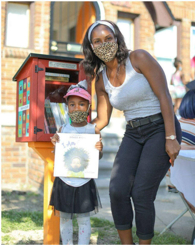
A family visits a Little Free Library in Detroit.