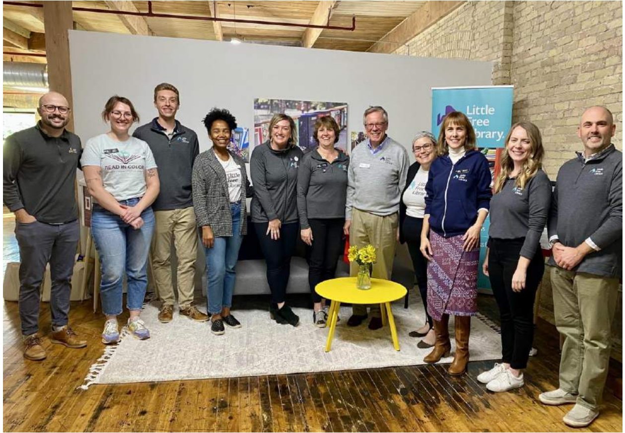
Little Free Library staffers in their new office space.