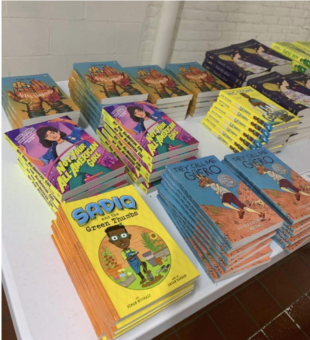
LFL gave away free books to the Little Free Library stewards who attended the fall open house.