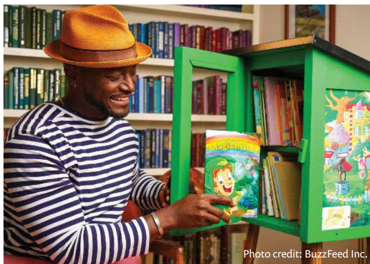
Taye Diggs finds a book in a Little Free Library funded by General Mills.

With your help, we can bring Little Free Libraries full of books to communities where books are scarce. Please give today. Any amount that is meaningful to you is needed now and greatly appreciated. Donate online at LittleFreeLibrary.org/donate or by using the enclosed envelope.