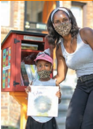
Pictured (left to right): Read in color launches in New York City and Detroit.

Our Read in Color initiative is distributing thousands of diverse books to Little Free Libraries nationwide. The program debuted in Minneapolis in 2020, and so far this year, we’ve launched in six additional cities: Washington, D.C., Boston, Detroit, New York, Kalamazoo, Michigan, and Tulsa, Oklahoma.