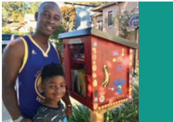
We support volunteer stewards around the globe, like this father-son duo in Oakland, California.