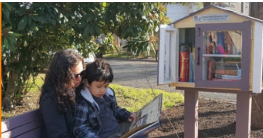
A boy reads on his mother’s lap at a Little Free Library in Austin, Texas.