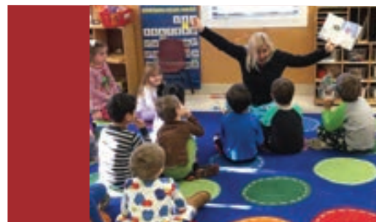
A preschool-age Action Book Club in Maryland read Good Night, Good Knight then did a pajama drive for a local shelter.